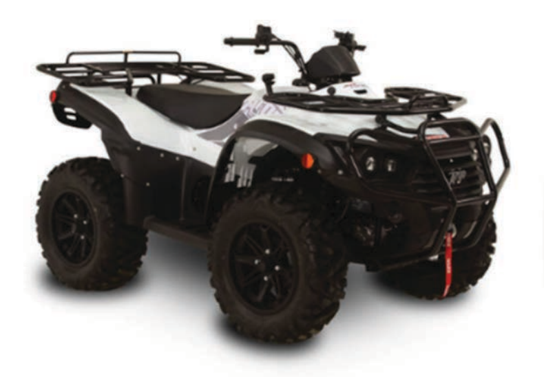
Recalled 2020 ARGO Xplorer XR 500 LE