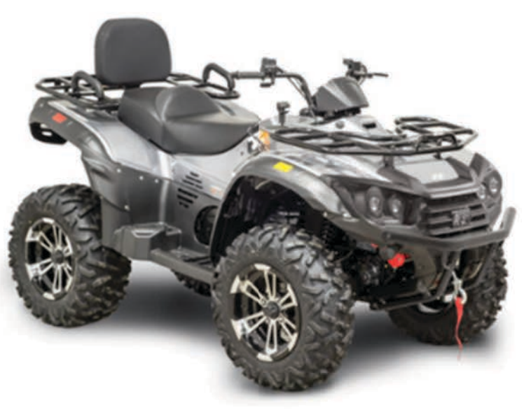
Recalled 2022 ARGO Xplorer XRT 570 LE