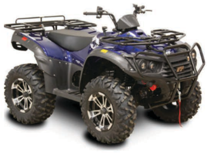
Recalled 2021 ARGO Xplorer XR 570 LE