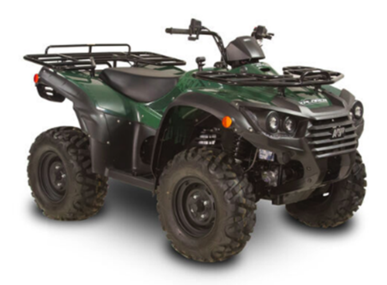
Recalled 2020 ARGO Xplorer XR 500