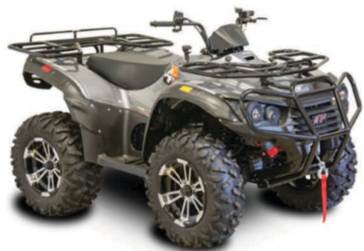
Recalled 2022 ARGO Xplorer XR 570 LE