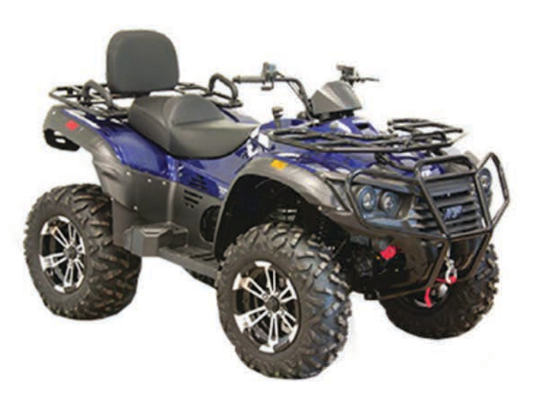
Recalled 2021 ARGO Xplorer XRT 570 LE