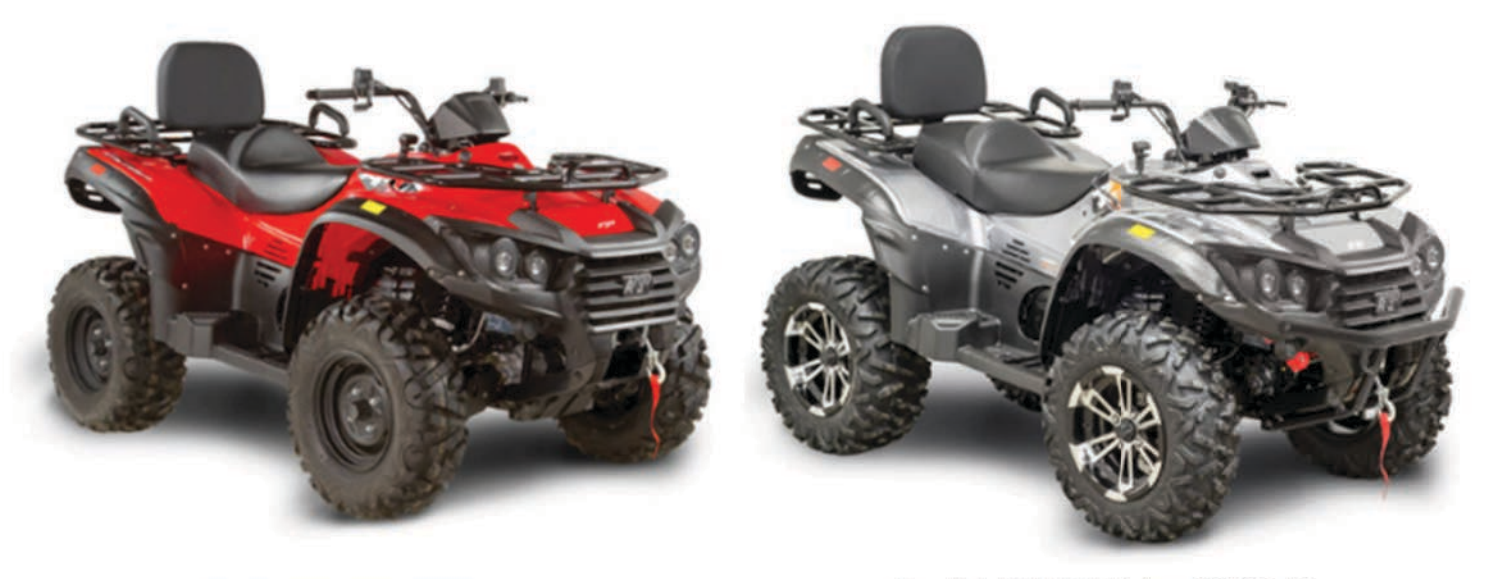
Recalled 2023 ARGO Xplorer XRT 570