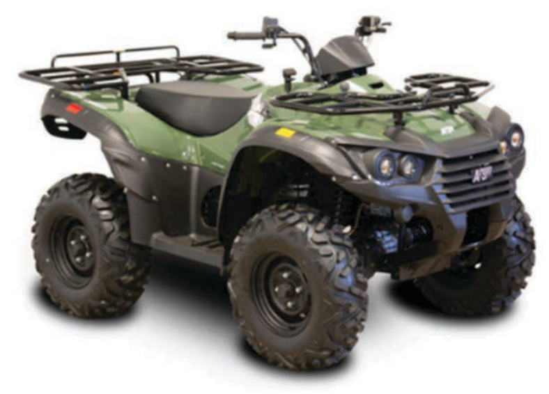
Recalled 2021 ARGO Xplorer XR 570