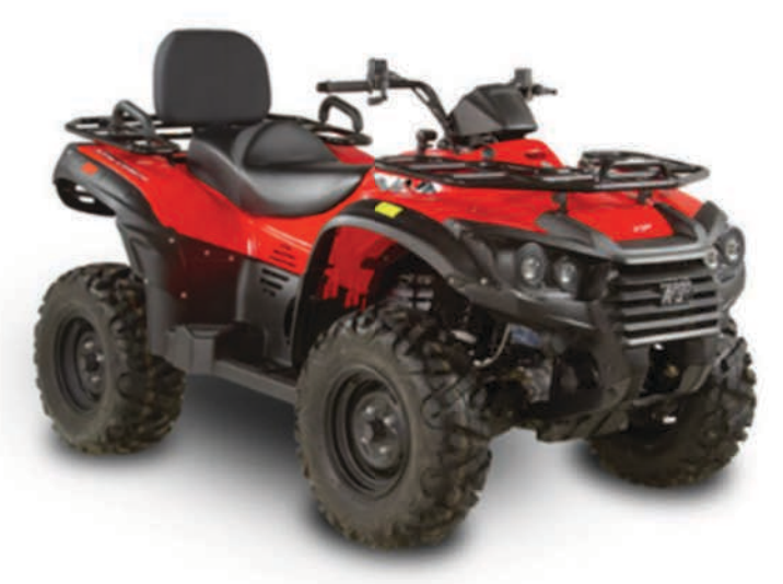
Recalled 2020 ARGO Xplorer XRT 500