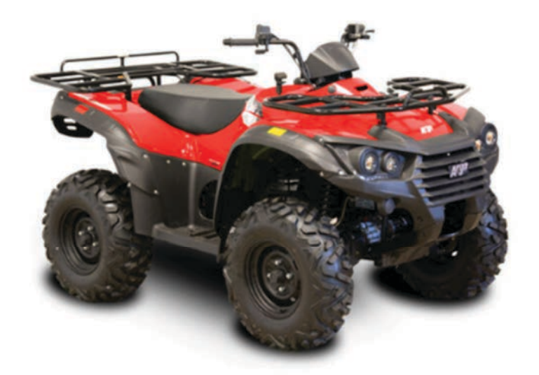
Recalled 2021 ARGO Xplorer XR 500