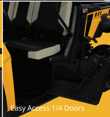
Easy Access 1/4 Doors