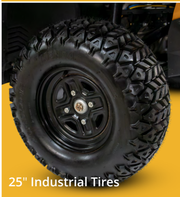
25" Industrial Tires