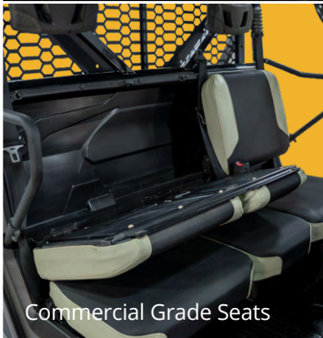
Commercial Grade Seats