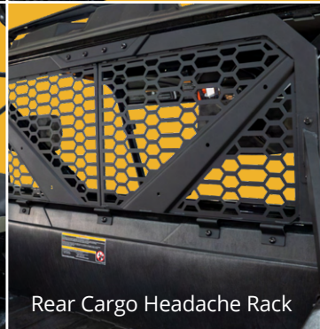
Rear Cargo Headache Rack