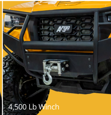
4,500 Lb Winch