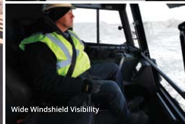
Wide Windshield Visibility