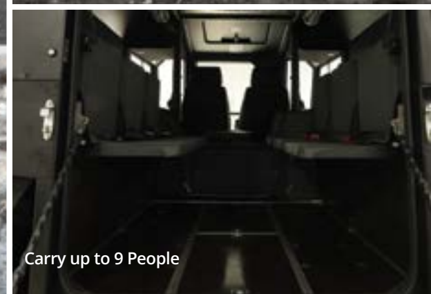
Carry up to 9 People