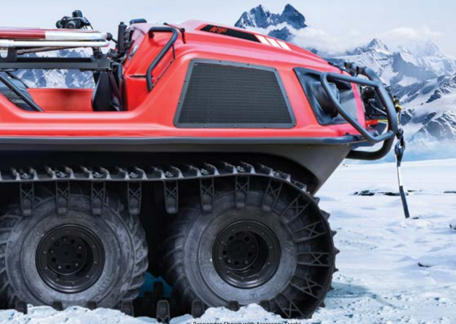
Responder Shown with Accessory Tracks