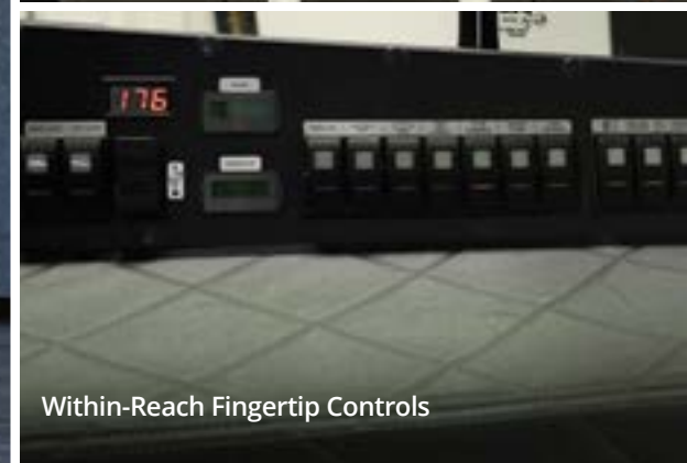
Within-Reach Fingertip Controls