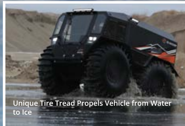
Unique Tire Tread Propels Vehicle from Water to Ice

The reliability, strength and durability of our patented suspension system (including tires and wheels that are lightweight and elastic), creates a high level of adhesion to the ground. The tires are self-inflating for optimum traction in snow, water, sand, mud or on hard surfaces. The full inflation cycle takes 30 seconds to reach full pressure.