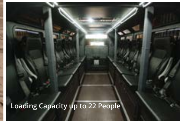
Loading Capacity up to 22 People