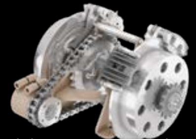
Hydraulic Skid Steering System Provides Superior Maneuverability