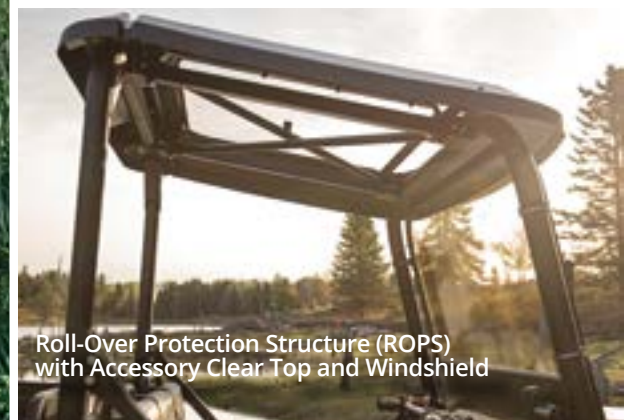
Roll-Over Protection Structure (ROPS) with Accessory Clear Top and Windshield