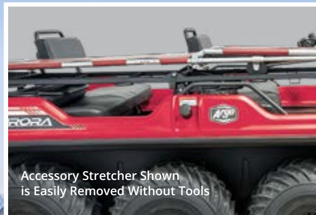
Accessory Stretcher Shown is Easily Removed Without Tools