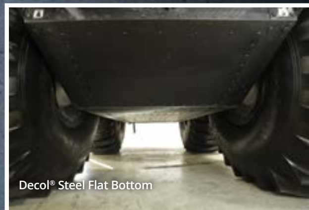
Decol® Steel Flat Bottom