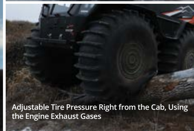
Adjustable Tire Pressure Right from the Cab, Using the Engine Exhaust Gases