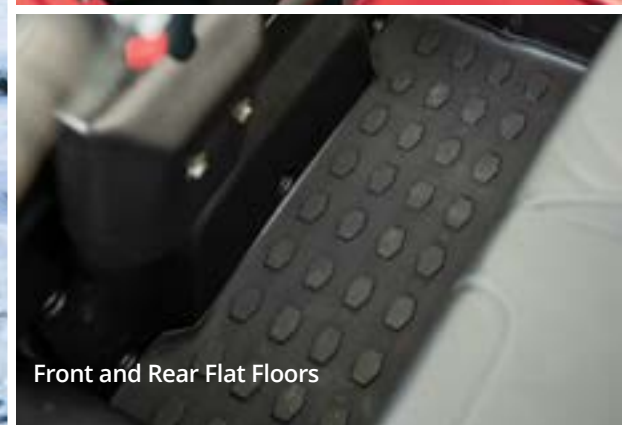
Front and Rear Flat Floors