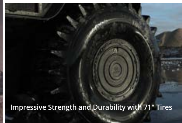
Impressive Strength and Durability with 71" Tires