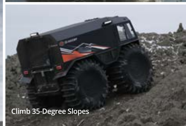
Climb 35-Degree Slopes