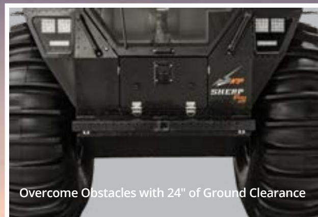
Overcome Obstacles with 24" of Ground Clearance