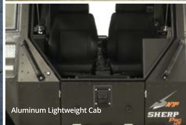
Aluminum Lightweight Cab