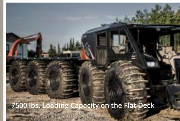
7500 lbs. Loading Capacity on the Flat Deck