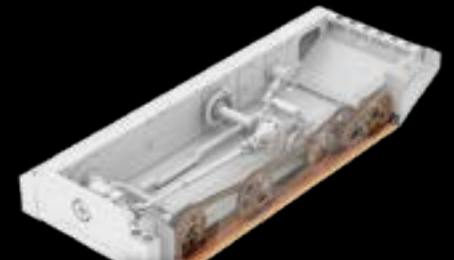
Unlike Hydraulic Motors and Belt Drives, Using Gears and Oil Bath Chains Provide Superior Reliability Under Extreme Conditions