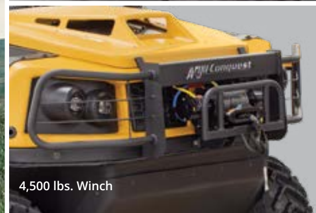
4,500 lbs. Winch