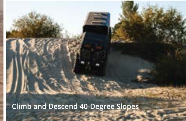
Climb and Descend 40-Degree Slopes