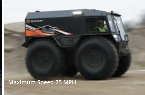
Maximum Speed 25 MPH