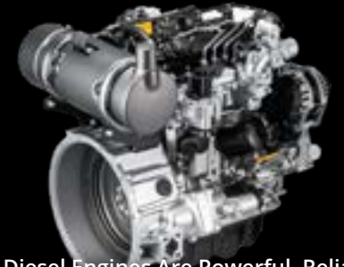
Doosan® Diesel Engines Are Powerful, Reliable and Fuel Efficient with Low Noise and Vibration