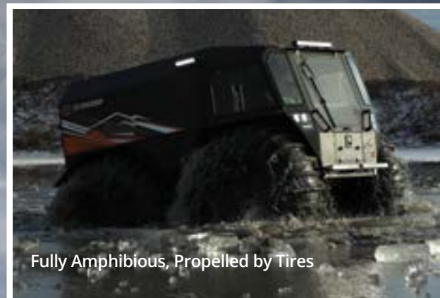
Fully Amphibious, Propelled by Tires