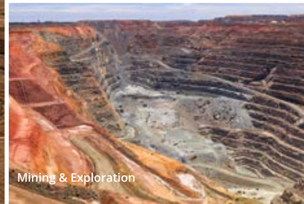
Mining & Exploration